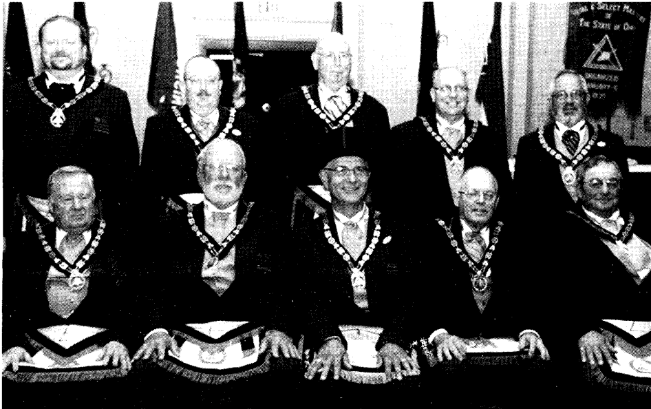
Grand Council Officers 2011-2012